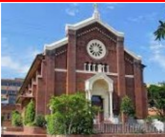
St Agatha's Church 52 Oriel Road, Clayfield

Thank you for your ongoing support to our parishes.