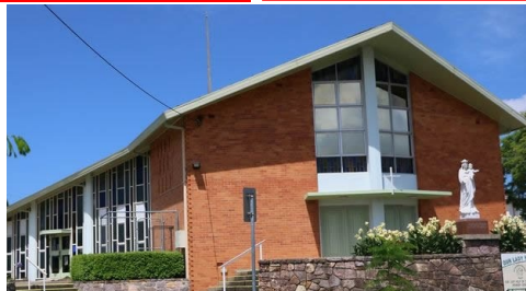
Our Lady Help of Christians Church 9 Bowman Street, Hendra