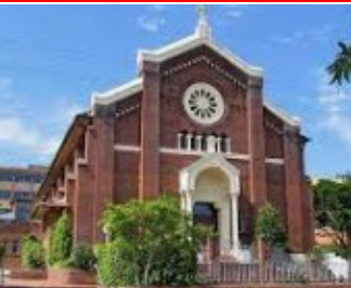
St Agatha's Church 52 Oriel Road, Clayfield

Congratulations and blessings to the children who will be receiving First Holy Communion at St Cecilia's 4.30pm Mass and St Agatha's 8.00am and 5.30pm Masses this Sunday. May this special day be the start of a lifelong friendship with Jesus.