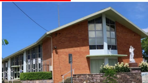
Our Lady Help of Christians Church 9 Bowman Street, Hendra