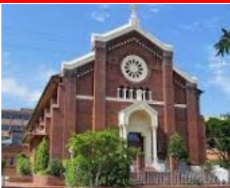
St Agatha's Church 52 Oriel Road, Clayfield

Happy Mother's Day to all the wonderful mothers in our Parish. Many blessings today and always!