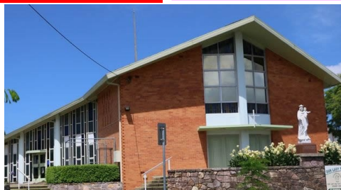
Our Lady Help of Christians Church 9 Bowman Street, Hendra