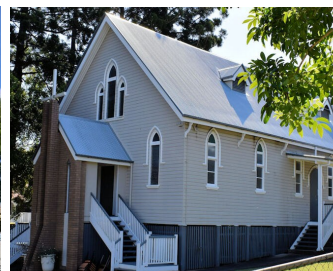
St Cecilia's Church 30 College Street, Hamilton