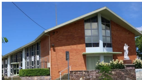
Our Lady Help of Christians Church 9 Bowman Street, Hendra