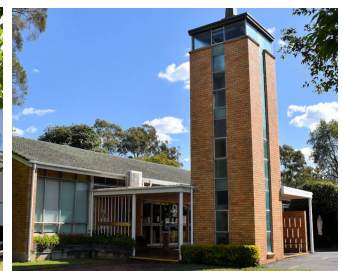
St John's Church 688 Nudgee Road, Northgate