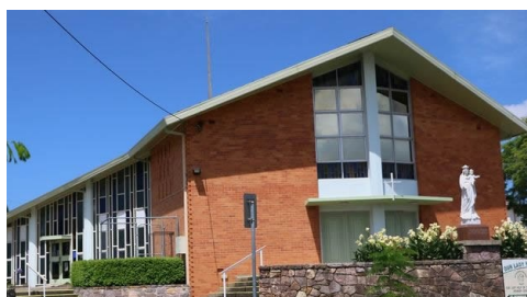
Our Lady Help of Christians Church 9 Bowman Street, Hendra