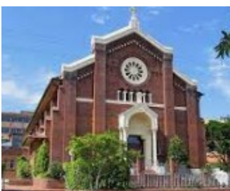
St Agatha's Church 52 Oriel Road, Clayfield