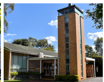
St John's Church 688 Nudgee Road, Northgate