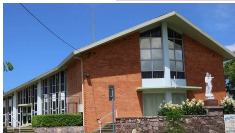
Our Lady Help of Christians Church 9 Bowman Street, Hendra