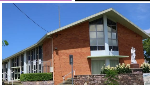
Our Lady Help of Christians Church 9 Bowman Street, Hendra