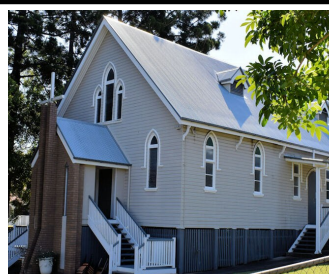
St Cecilia's Church 30 College Street, Hamilton