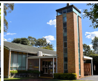
St John's Church 688 Nudgee Road, Northgate